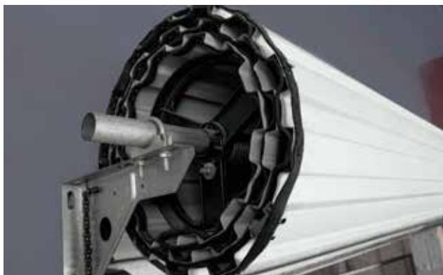
Superior quality features

Our Roll-Up doors boast superior quality features, install easily and can be adjusted for larger opening heights by simply increasing the length of their tracks.